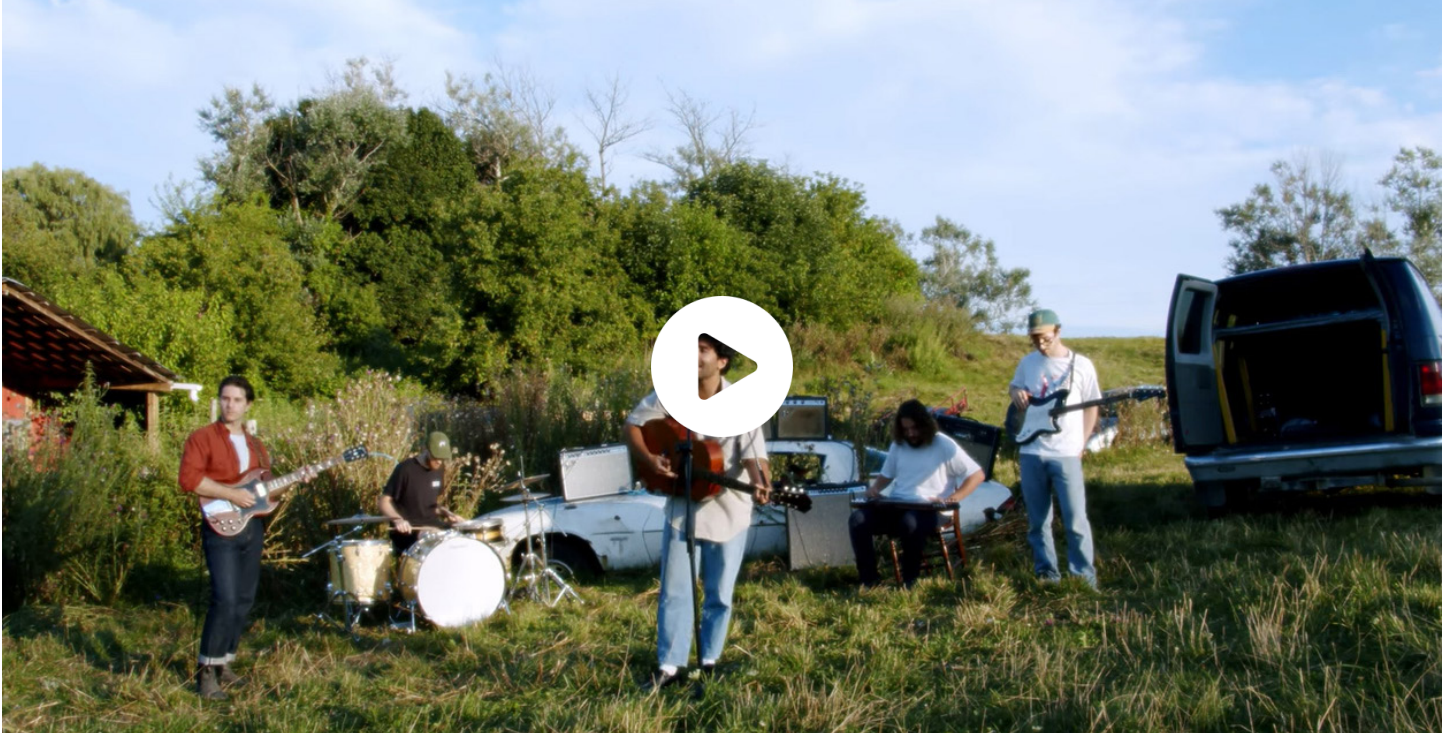
HIS HIS - GET-GO (OFFICIAL VIDEO)