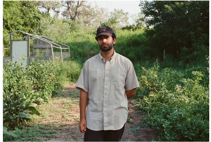
DOWNLOAD HI-RES PHOTO: LANDSCAPE / PORTRAIT