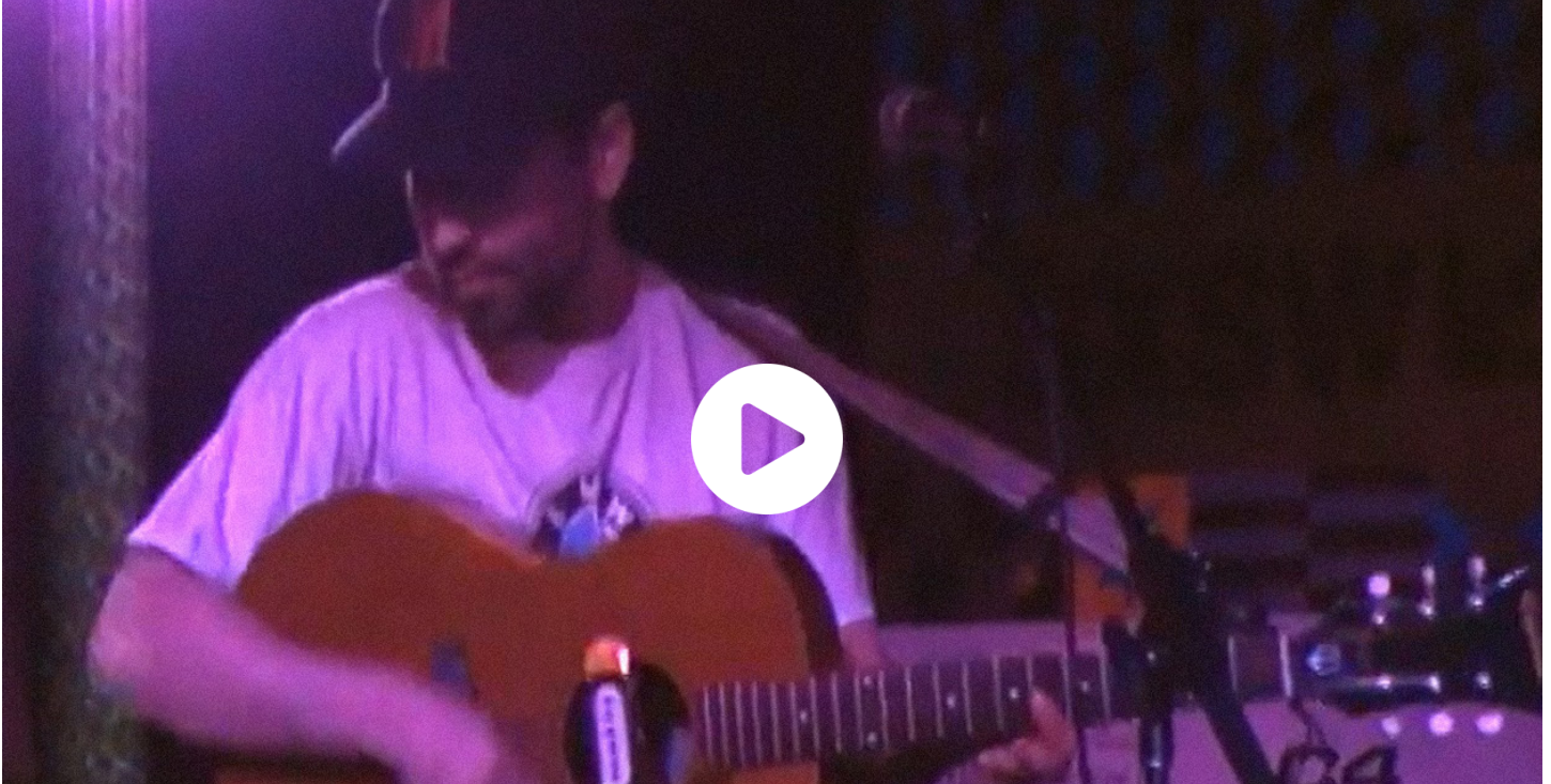
LIVE AT SXSW 2024 (BIRM FM SHOWCASE)